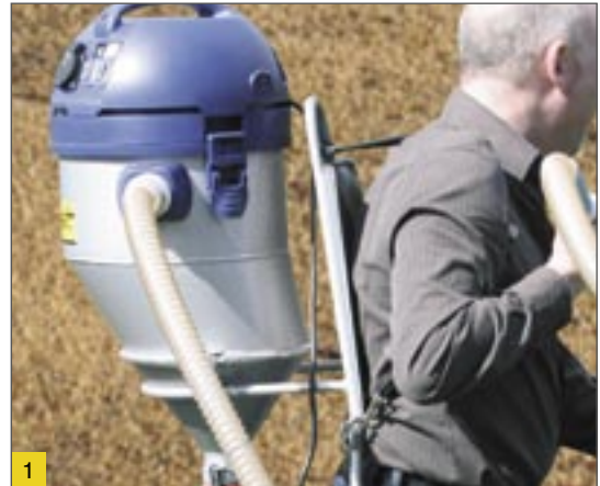
Fig. 1: Sampler carrying unit with shoulder straps

(Changes to technical progress reserved.)