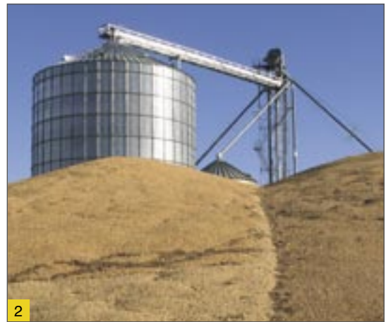
Fig. 2: The range of application also includes grain silos